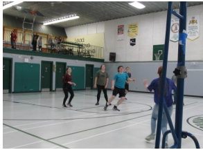
Staff vs. Seniors