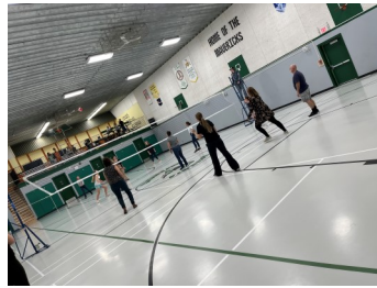
Staff vs. Bantams