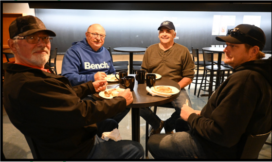
Our Fearless Bus Drivers