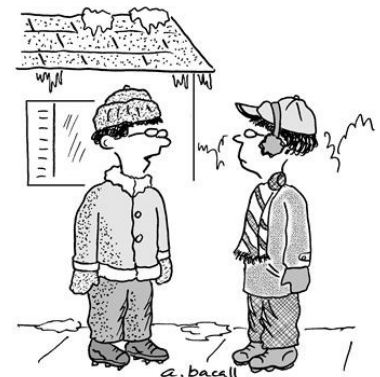
"My mom is an English teacher and she says Santa's elves are subordinate clauses."