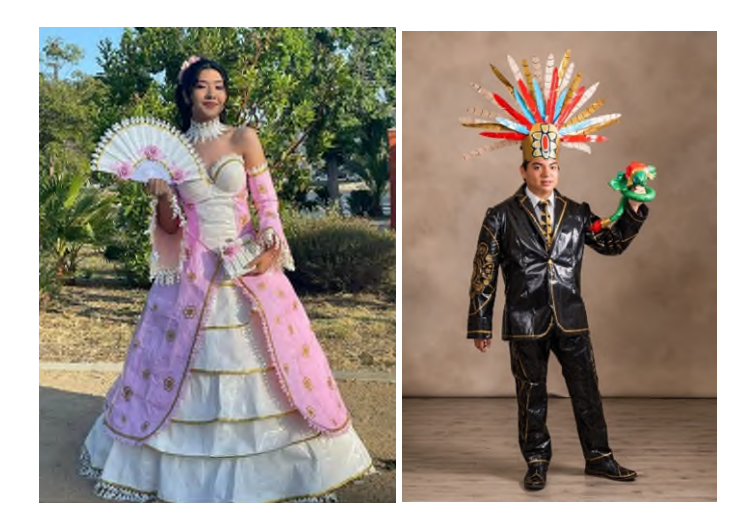
Need some help? Check out the links. Ever make a duct tape bow tie?

Love duct tape and could use a $10,000 scholarship? We have the scholarship for you. The <u>Stuck at Prom</u> contest simply requires you to create your grad dress or tux completely out of duct tape. Even if you prefer not to strut in a duct tape gown or tux, you'll want to check out the creative <u>past submissions</u>. Contest is open March 30 to June 8. See <u>FAQs</u> for more information.