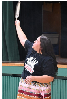
Showing us her eagle feather.